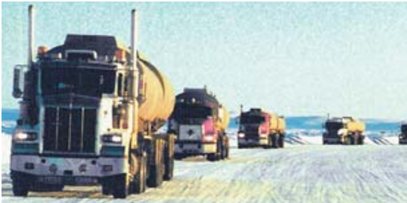
Askiy pimi e pimawataniwak pioni meskanak ote kiwetinok Canada