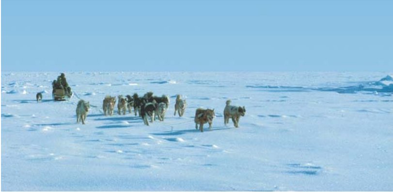
Tli tthi dtadaghoti hoketzidel nadli yadthegheh Kivaliq k'eyagha