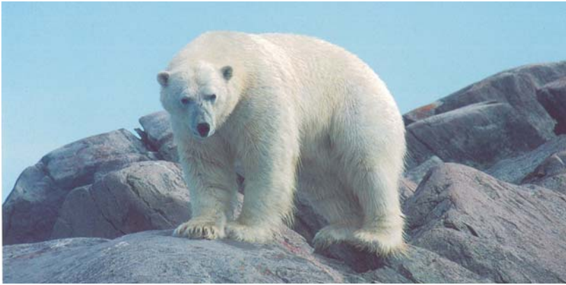
Polar bears frequent the western shore of Hudson Bay